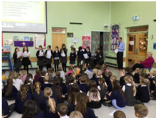
3 - Creation Club's reading