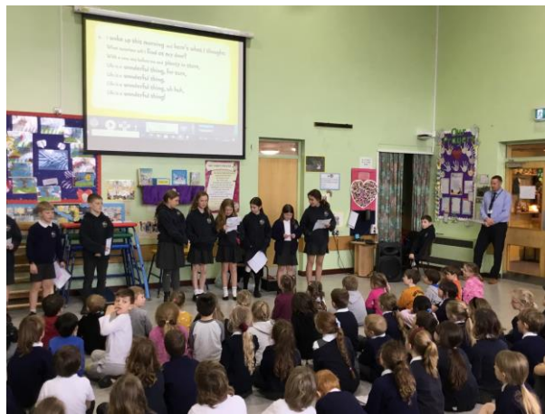
2 - Class 5 performing their Easter Poem