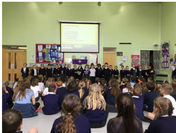
5 - Class2 performing their Easter Poem