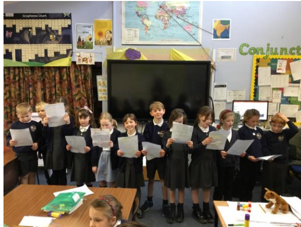
1 - Class 3 rehearsing their Easter Poem