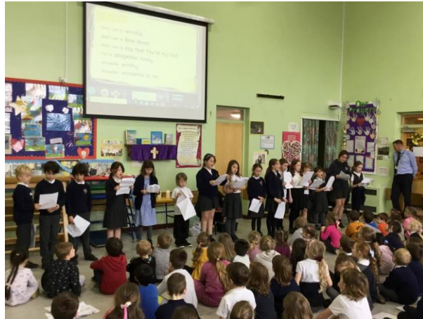
4 - Creation Club singing